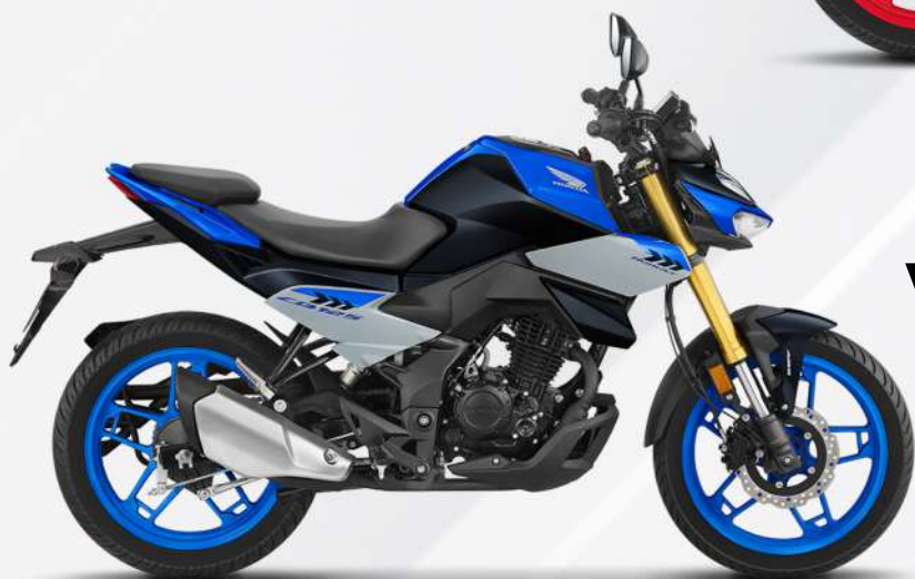
Pearl Siren Blue with Athletic Blue Metallic